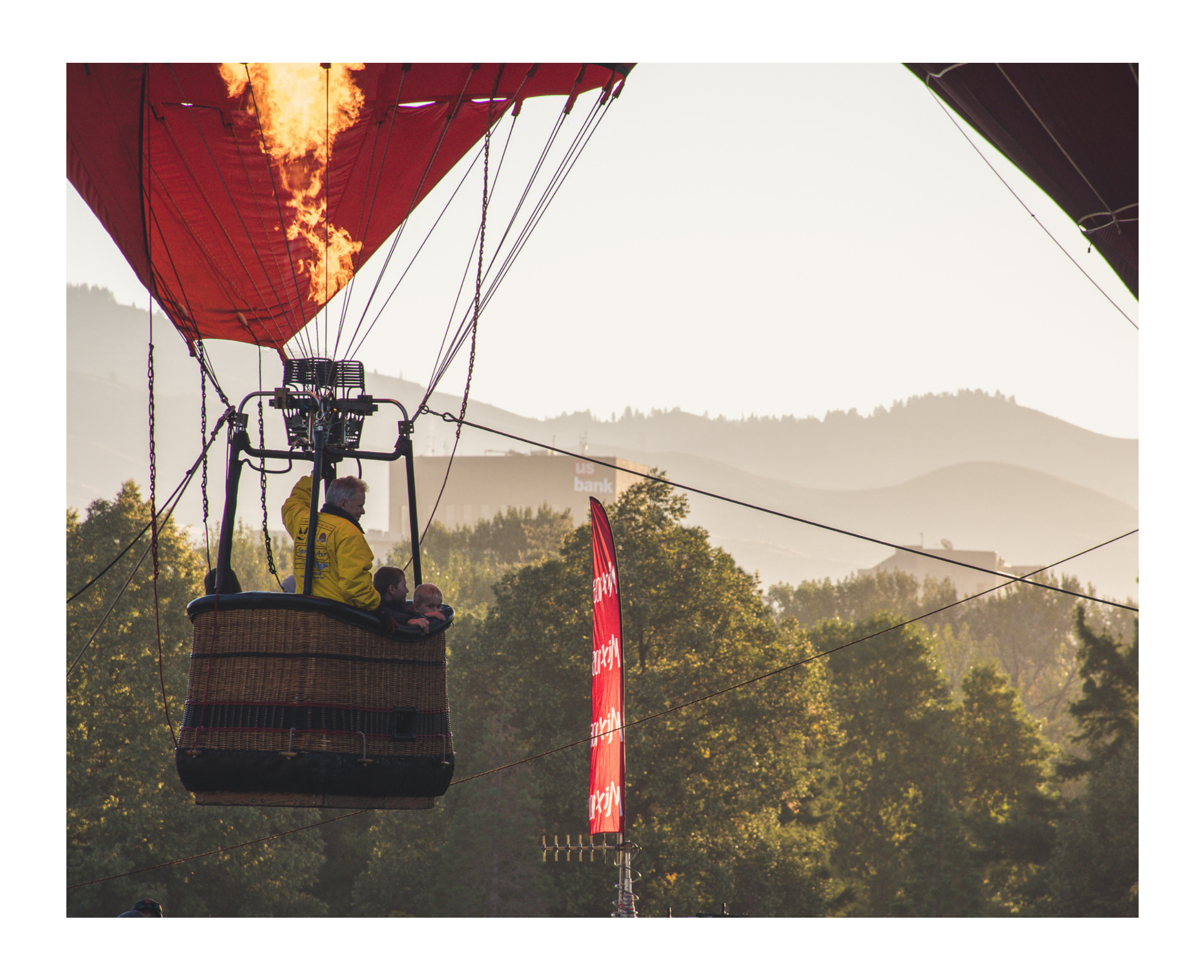
Next is "full of hot air".

What does it mean to be full of hot air? You can say politicians are full of hot air. You can say that about anybody that's not telling the truth. Maybe they give a lot of promises, but they're not fulfilling them.